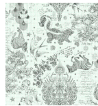
Backing 44" (111.76cm)