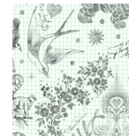
Backing 108" (274.32cm)